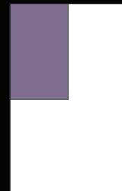
QUARTER PAGE (3.75" x 2.25")