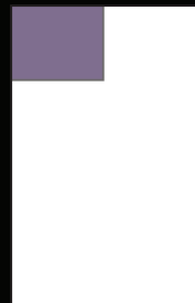
EIGHTH PAGE (1.875" x 2.25")