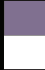
HALF PAGE (3.75" x 4.75")